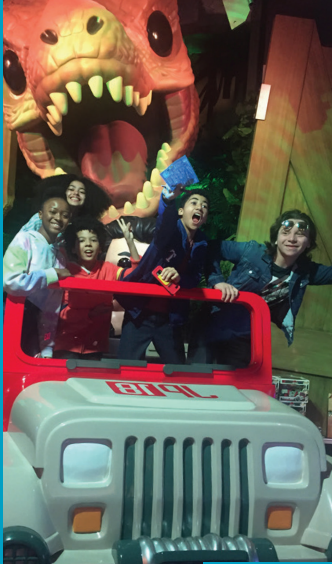
The Actors Fund's Looking Ahead programs and services build a community of support for young performers in Los Angeles and New York City.