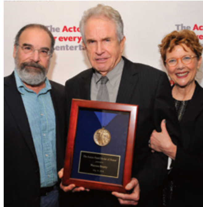
Warren Beatty (center) received The Actors Fund Medal of Honor from Mandy Patinkin (left) and his wife, Trustee Annette Bening (right) at our Annual Gala.