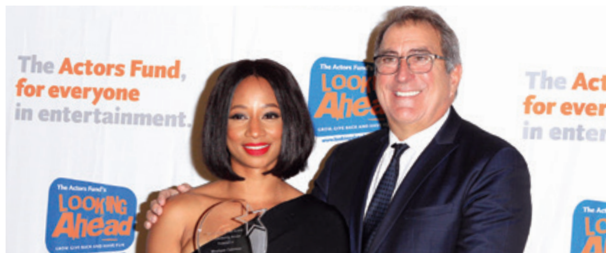
Our Looking Ahead program in Los Angeles, now expanded to New York City (p. 18-19), honored Monique Coleman with Looking Ahead Award for Community Service, presented by Kenny Ortega.