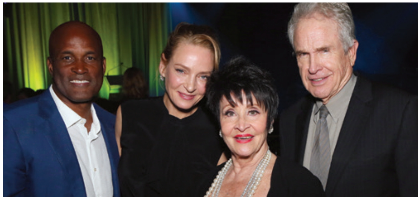
The Actors Fund Annual Gala honored (l-r): Kenny Leon, Uma Thurman, Chita Rivera and Warren Beatty.