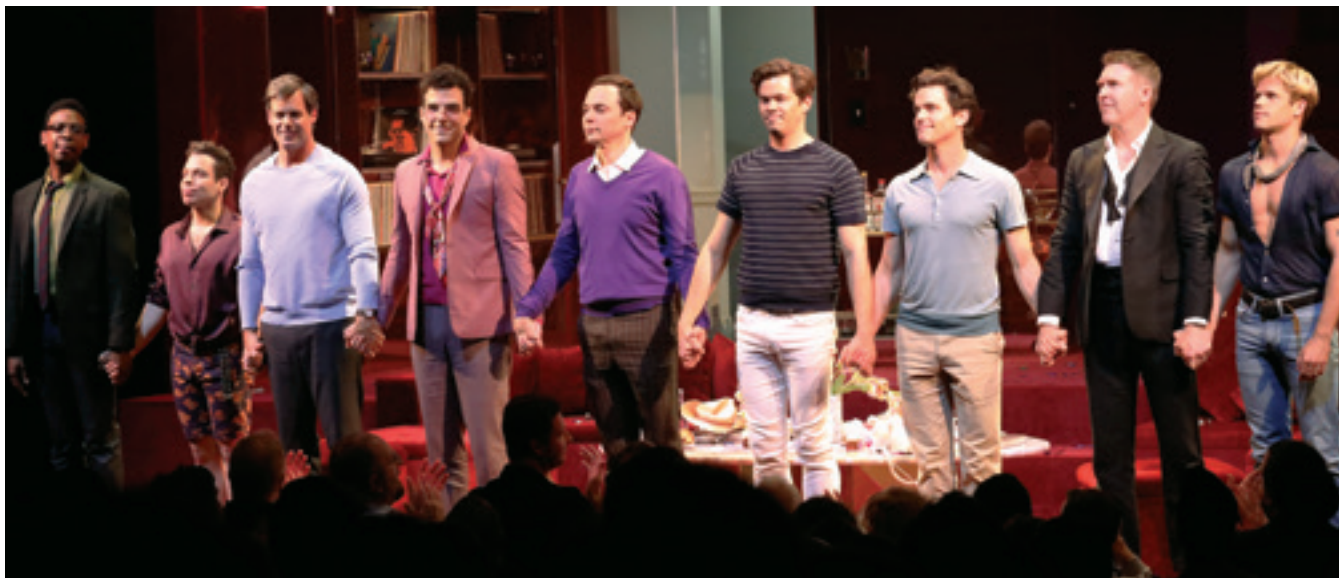
Thank you to the company of The Boys in the Band for their Special Performance.