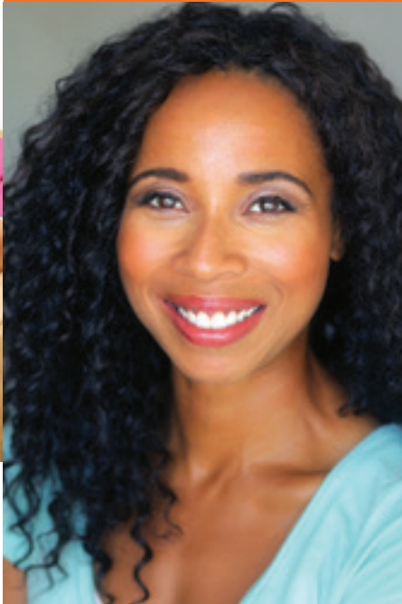
The Career Center