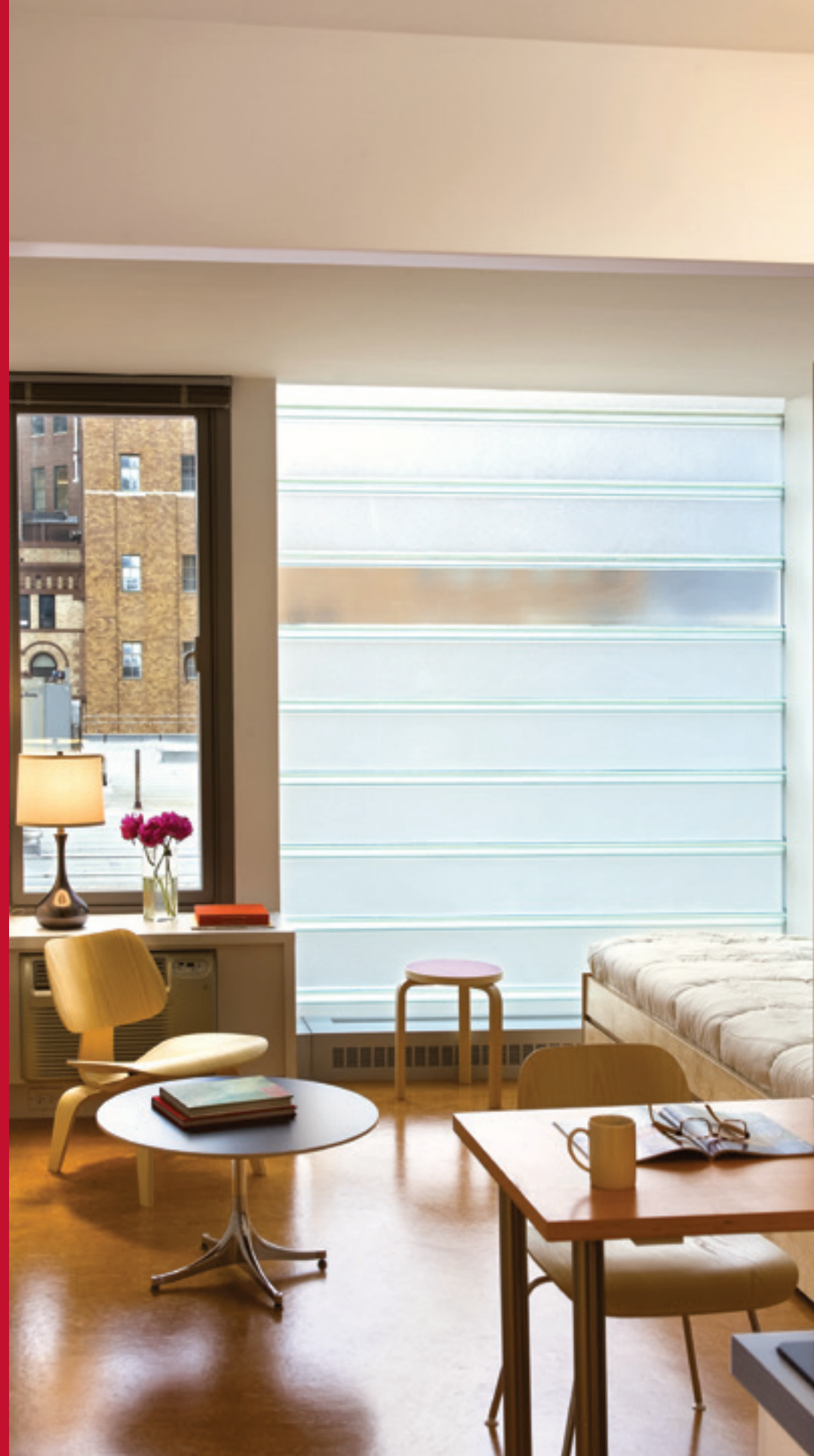
The Schermerhorn, Brooklyn, NY