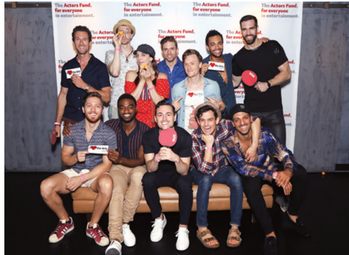
Broadway stars joined our Celebrity Paddle Battle fundraiser in NYC, hosted by our Young Professionals.