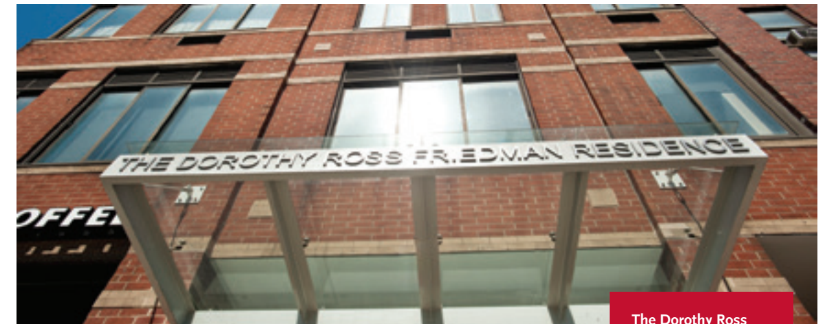
The Dorothy Ross Friedman Residence, New York City

We advocate for more housing for our community. Our Actors Fund Housing Development Corporation seeks out housing opportunities through strategic partnerships and marketing of new affordable housing developments.