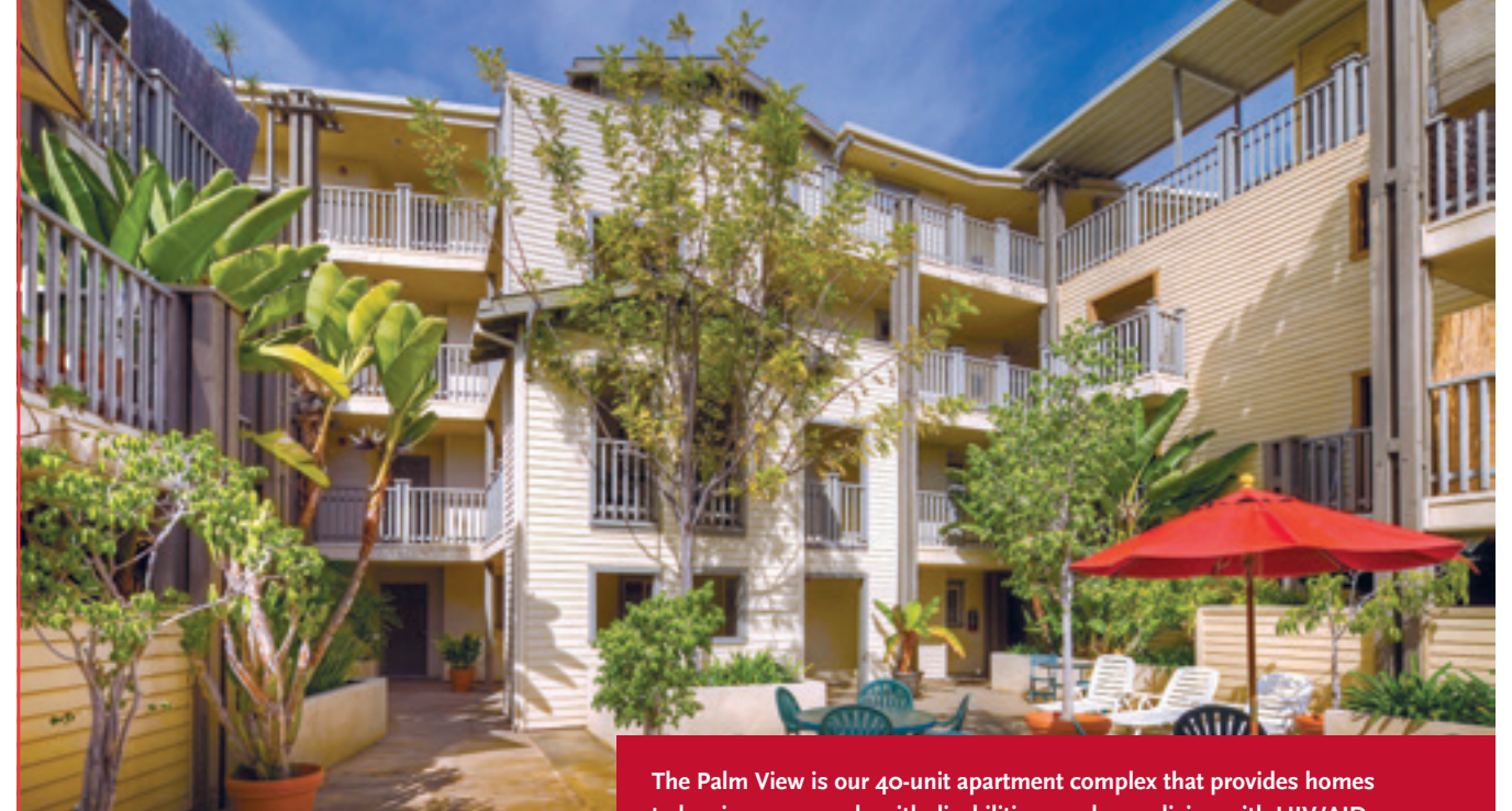
The Palm View is our 40-unit apartment complex that provides homes to low-income people with disabilities or who are living with HIV/AIDS in West Hollywood, California.

We advocate for more housing for our community. Our Actors Fund Housing Development Corporation seeks out housing opportunities through strategic partnerships and marketing of new affordable housing developments.