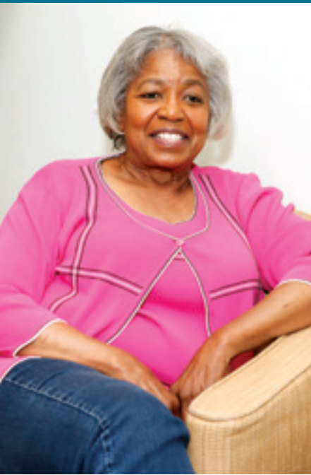
Social Services and Emergency Financial Assistance